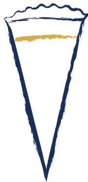
SHARE YOUR SLICE OF ANY SIZE